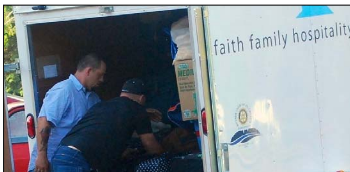
TRAILER HOME: A trailer helps move family belongings from church to church each week for FFH.