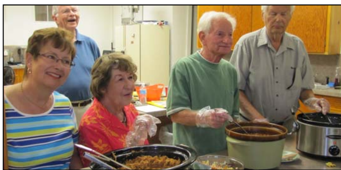
SOUP’S ON: FPC volunteers serve meals and a spoonful of hospitality for FFH.