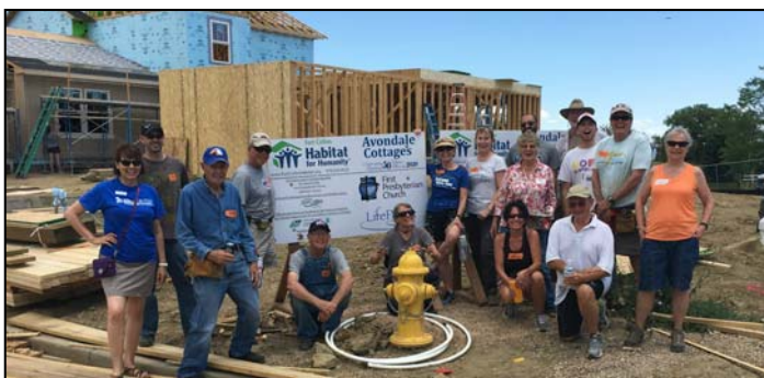
BUILD DAY: Members of FPC found many ways to lend a hand in building the Bhattis’ Habitat home this summer.